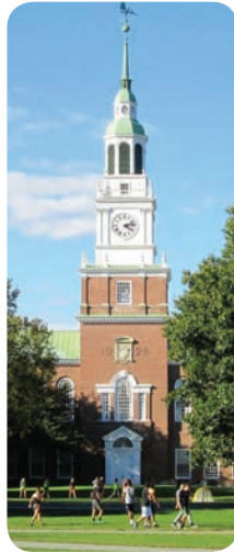
Three years on Dartmouth College campus

We continue to advocate for a considerable number of Dartmouth survivors. Our goals center on advocating, being accessible to survivors on campus and increasing our outreach efforts to ensure that WISE is a well-known resource among the student population. We continue to work closely with the Title IX office to ensure that survivors who come forward are aware of WISE on campus and understand that they can have an advocate present with them at meetings throughout campus processes. We have seen an increase in survivors accessing WISE from building this relationship with the Title IX office.