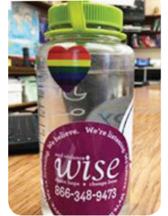
As seen in Woodstock