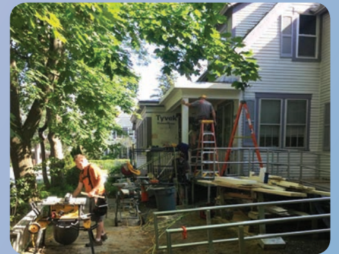
Our new Program Center porch

Do not forget to reserve a spot for our breakfast on November 14. We will share with you the many things we do every day to end gender-based violence. Come start the day with us, enjoy a healthy breakfast, and leave energized with all things WISE. Call Lisa to reserve a spot. 603-448-5922 extension 118.