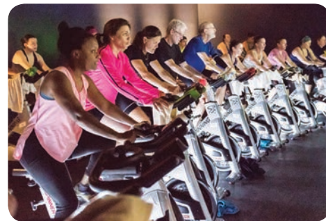
2017 RVC Spin-a-thon

"No one can do everything, but everyone can do something." This well-known saying came alive this past year with a record number of community members who helped to raise money for us through their own generous sweat equity. Over sixty-five individuals participated in either the River Valley Club's Spin-a-thon or the Covered Bridges Half Marathon, and each of them reached out to friends, family, colleagues and neighbors for the benefit of WISE. Our successful fundraising year was based in large part on these wonderful spinners and runners, and even more importantly, their efforts demonstrate a desire to participate in the important work to end gender-based violence. This is quite something, indeed.