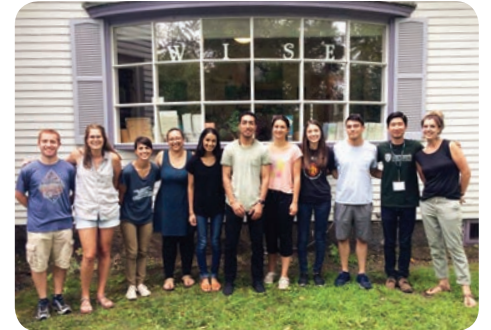
2017 Dartmouth Medical Students

As we start our third year in partnership with Dartmouth, we have greater opportunities to do outreach on campus. We are included in many orientation activities for both the undergraduate and graduate schools, as well as training staff. With the increased visibility, we have the ability to discuss WISE as a resource with both incoming students and professionals responding to disclosures.