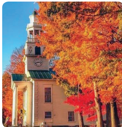
Fall in Windsor, Vermont

The three-year grant of $490,382 will develop a coordinated, trauma-informed response to victims of sexual assault, domestic violence, and stalking in these communities, and address needs specific to youth and immigrant victims. Project partners include Mount Ascutney Hospital and Health Center, Windsor County Unit for Special Investigation, Windsor County State Attorney Office, Welcoming All Nationalities Network (WANN), The Junction Teen Life Center/The Listen Center, The Upper Valley Haven, and The Good Neighbor Health Clinic.